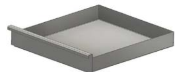
Ash tray airtight Conversion set for external combustion air- sizes suitable for: FRAM K/70, K/75, K/80, K/95