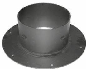
Flue gas connection piece Ø 150 mm or Ø 180 mm

The following accessories are available for the installation of the FRAM fireplace cassettes: