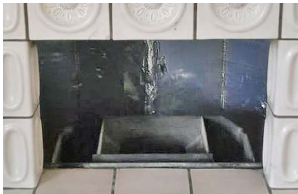
Before: open fireplace