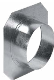
Hot air connection nozzle 3 sizes: Ø 100, Ø 125 und Ø 150 mm