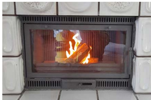
After: with a custom made cassette